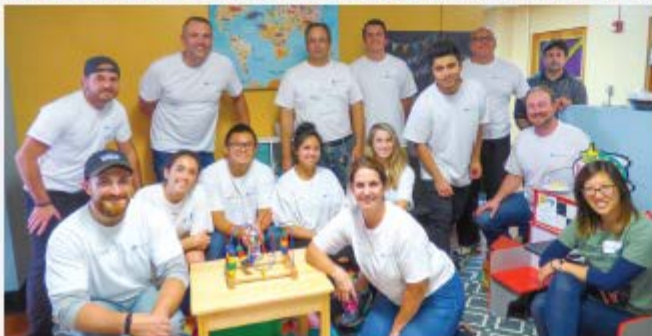
Pfizer & FCI Consultants worked together to redesign the Family Lounge at our Main Shelter.

Pfizer recognizes that it is hard to face the challenges of a new day when you aren't rested and fully charged. Their hope with the remodeled lounge is that our families can relax and spend more time together while briefly forgetting about any difficulties or worries of the day.