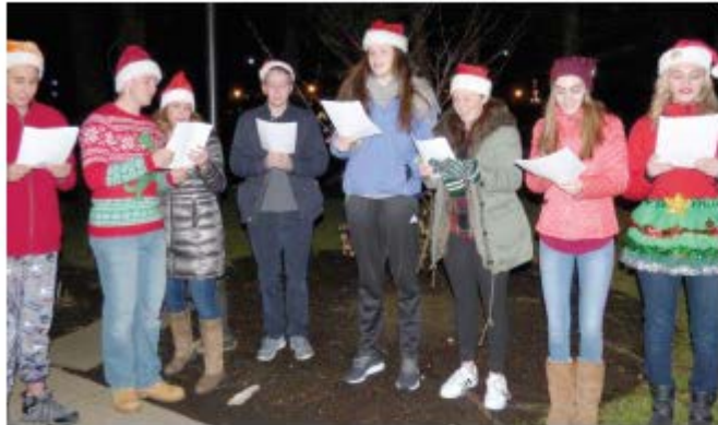
We got a visit from Carolers! The Assumption Youth group brought some holiday cheer to our shelter guests singing classic Christmas songs.

As you can imagine, the holidays are a difficult time for our shelter guests. We are so fortunate to have many groups and individuals that help make the holidays a bit brighter, from gifts and parties to decorated trees and even carolers!